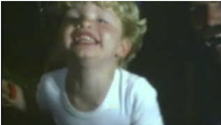
Lip Sync to Love Songs (Lyric Video)