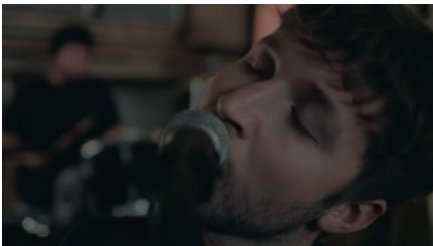
Home Is Where the Heart Hurts Pt. 1 (Live)