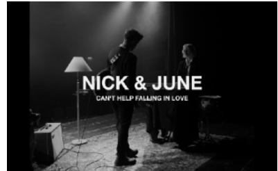
Can't Help Falling in Love (Music Video)