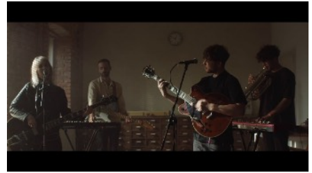
Manic Pixie Dream Girl (Live)