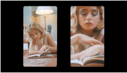
Anything But Time (Music Video)